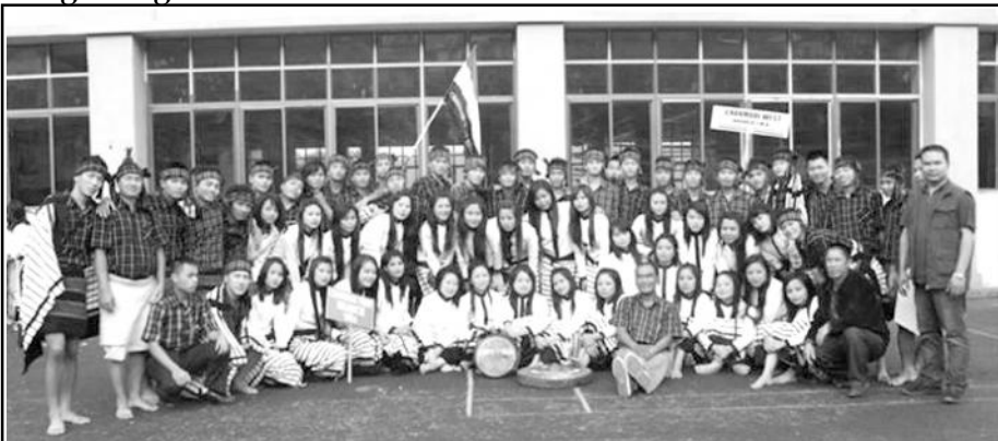
Hnam Lam intihsiakna Lawmman 2-na latute